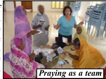
Praying as a team

the presence of Pr. Viki's team, the village workers were divided into 13