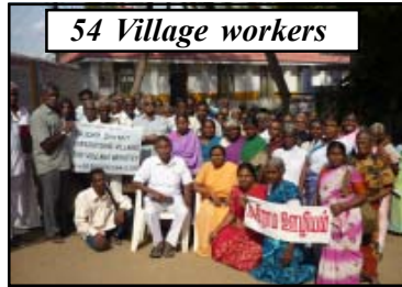
54 Village workers

By the grace of God, the 100-Village Ministry was held in the villages surrounding the important villages of Archampatti, Adavathur and Santhoshnagar situated nearby Trichy town. Arrangements had been made for an exclusive preaching and a special feast for the village workers for 2 days on 10.11.2008 and 11.11.2008 at the TVGM head quarters.