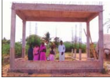
Arakkonam - Melpakkam

Pray that the lord increase the faith of those who are building prayer houses by faith, with vision given by God