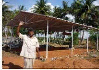
Vedasandur - Pudhu Road