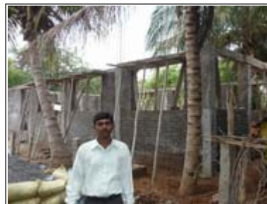
Trichy - Vadugarpettai

By the immense grace of our Lord, in the month of April we were able to visit 21 villages in the districts of Thiruvallur, Kancheepuram, Thiruvannamalai, Villupuram, Salem, Dindugal, Sattur, Koilpatti and Srivilliputhur, pray in these unions with those ministers and hear their faith stories.