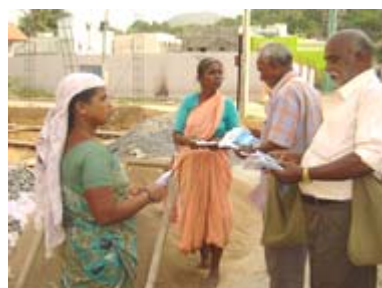
Sharing the Gospel