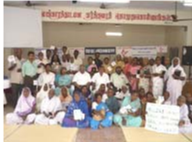
Forty four 100-Village workers participated in the ministry

No. of addresses collected from non-Christians : 188