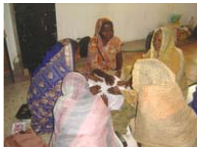
Praying as group