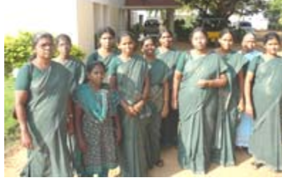
Promotional Office Staffs